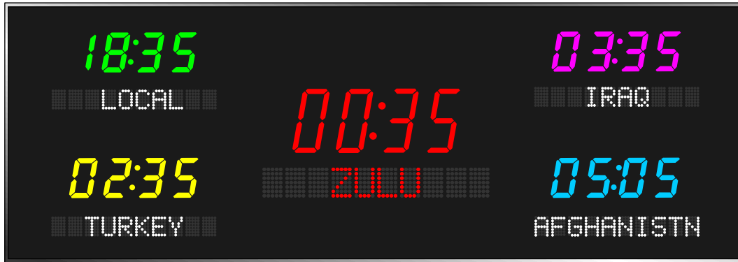
Model 6614B - 4.0" center zone time & 2.0" zone labels, 2.5" perimeter zone time & 1.2" zone labels, 5 zones